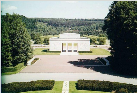
Epinal American Military Cemetery and Memorial, France