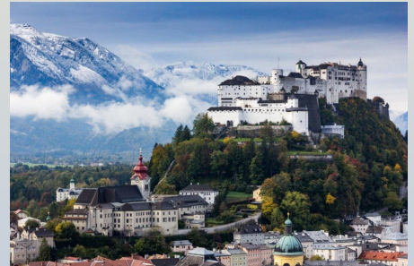
Salzburg, Austria: a UNESCO World Heritage Site

Our trip is being organized through Fitness Travel France, Inc. , a veteran-owned agency with years of experience providing European military history tours.