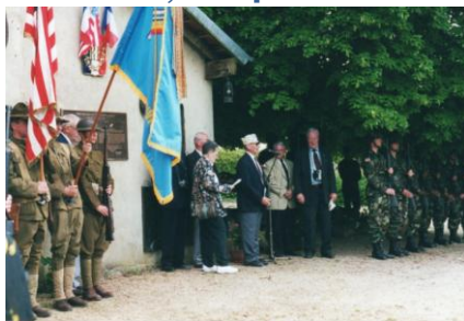
Meurcy Farm FR 27 May 2001 original dedication of WWI Rainbow plaque for the Battle of the River Ourcq