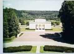
Epinal American Military Cemetery and Memorial, France