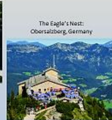
The Eagle's Nest: Obersalzberg, Germany