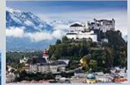
Salzburg, Austria, a UNESCO World Heritage Site

Our trip is being organized through Fitness Travel France, Inc., a veteran-owned agency with years of experience providing European military history tours.