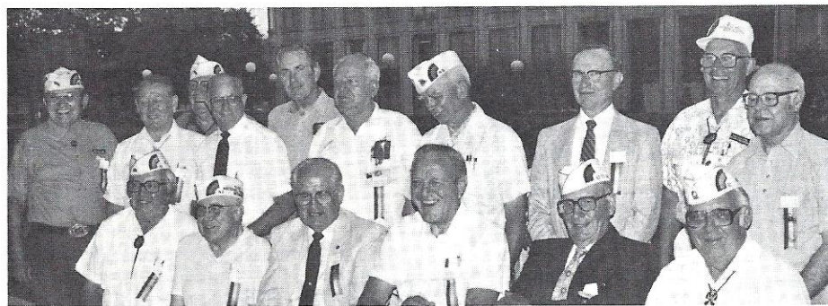
Rainbow Division Past National Presidents attending the Pittsburgh Reunion.