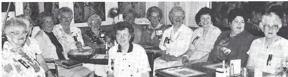
Rainbow Division Auxiliary PNPs in attendance at Pittsburgh.