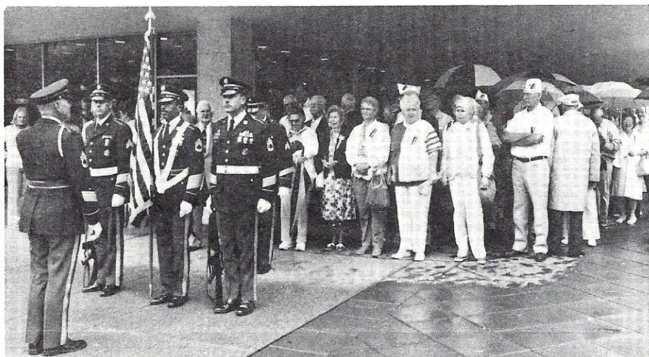
Honor Guard prepares to lead RDVA to Memorial Service.