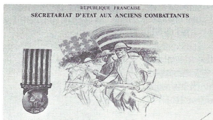
Citation and Medal