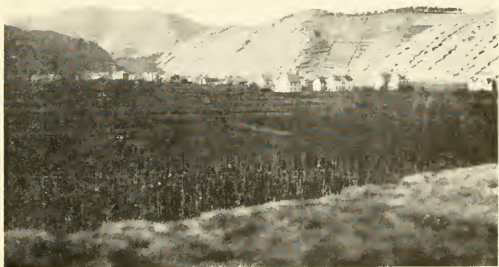
Terraced Vineyards about Dernau, Germany, where the 149th Spent Christmas, 1918