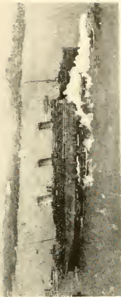
Home at Last—The Leviathan Steaming up the Hudson