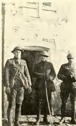
Three Corporals Ready to Hike