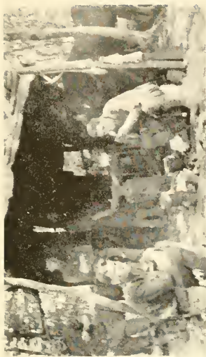
Horseshoers' Shop at the Mercier Horse-lines