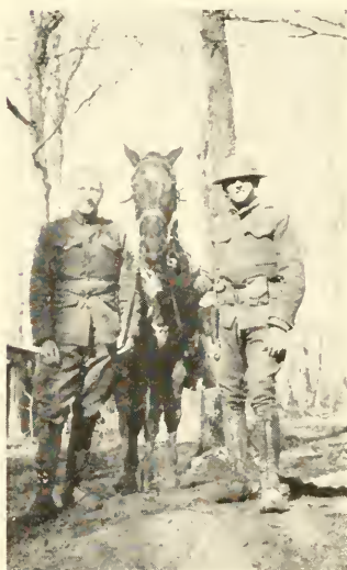
The Battery Clerk and the Courier