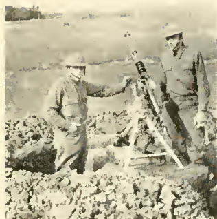
Machine Gun Mounted for Air Craft