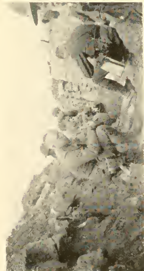
B. C. Detail at Observation Post near Ancerville