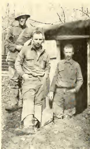
Home Life in a Dug-Out