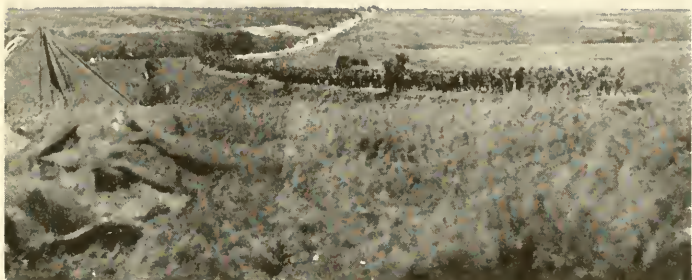
Highways Swarmed with Troops Advancing to Clear the St. Mihiel Salient