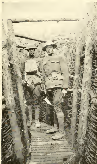
En Route to the O. P.