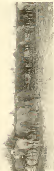
Picket Lines in the Snow at Ringen, Germany