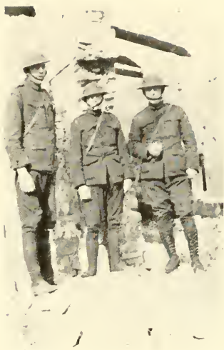
Three Sergeants in Romenoville's Ruins