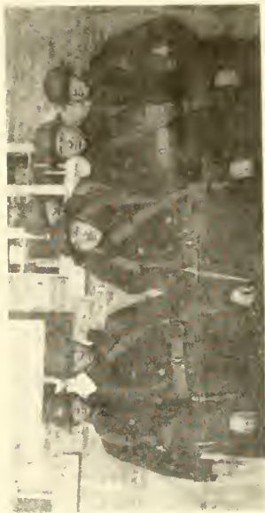
Ready for the Review by General Pershing, March 16, 1919