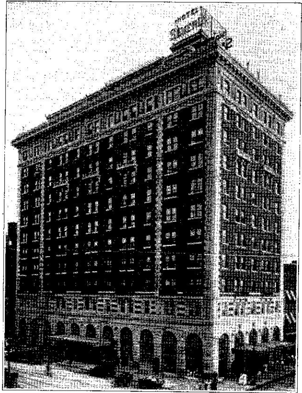
Convention Headquarters, Indianapolis