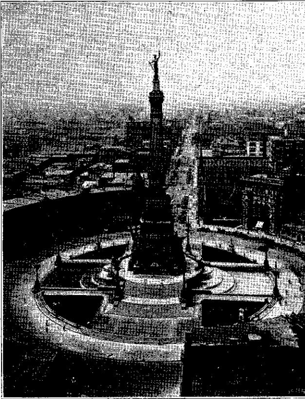
Soldiers' and Sailors' Monument, Indianapolis

INDIANAPOLIS, INDIANA, JULY 13th, 14th, 15th