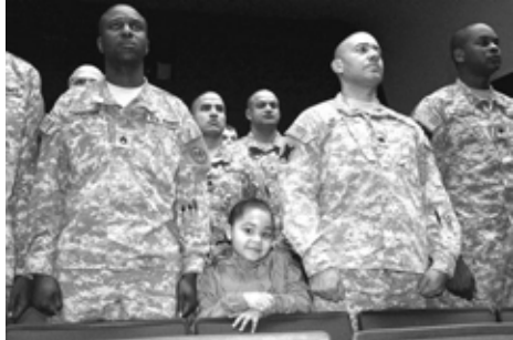
QUEENS, N.Y.

More than 130 New York Army National Guard Soldiers from the 1st Battalion, 69th Infantry Regiment and the 1st Battalion, 258th Field Artillery Regiment celebrated