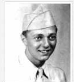
By Victor Lorenzetti

Under the cold winter skies of Northern Alsace we were unaware a superior force would strike soon. Spread out over large areas we were left isolated and unprepared. Our limited resistance offered what it could but it was not enough to prevent substantial casualties and, ultimately, capture.